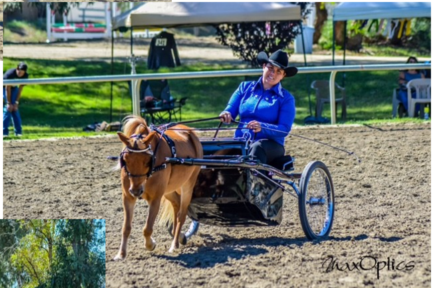
Mini Driving Class