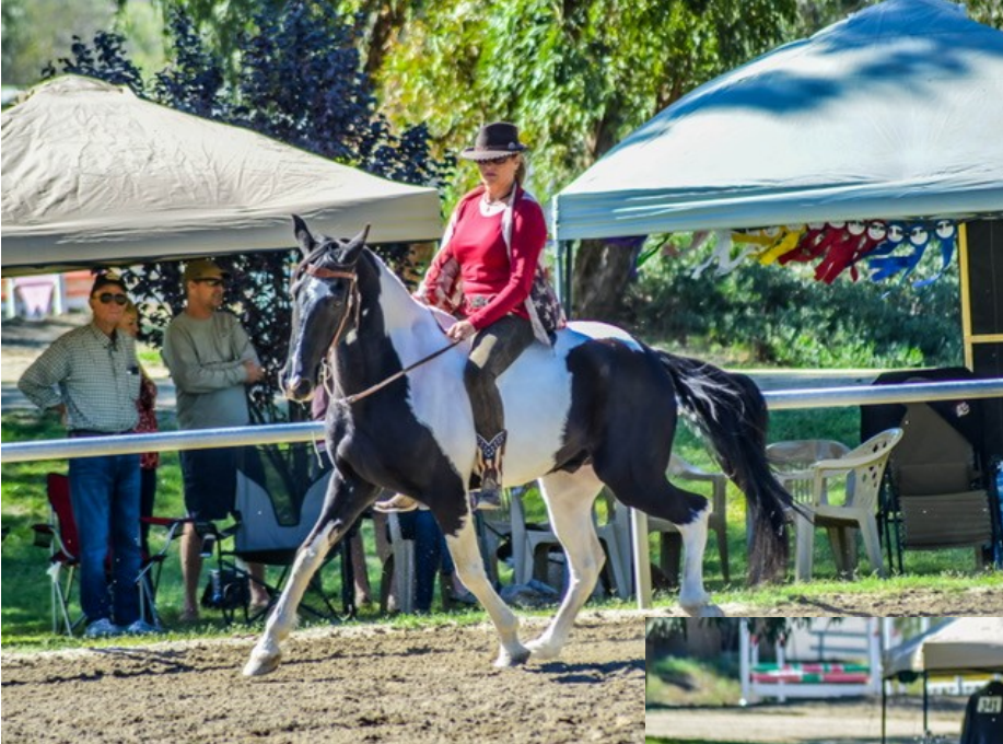
Gaited Bareback Class

More great pictures from the Annual Fall Show at Galway Downs: